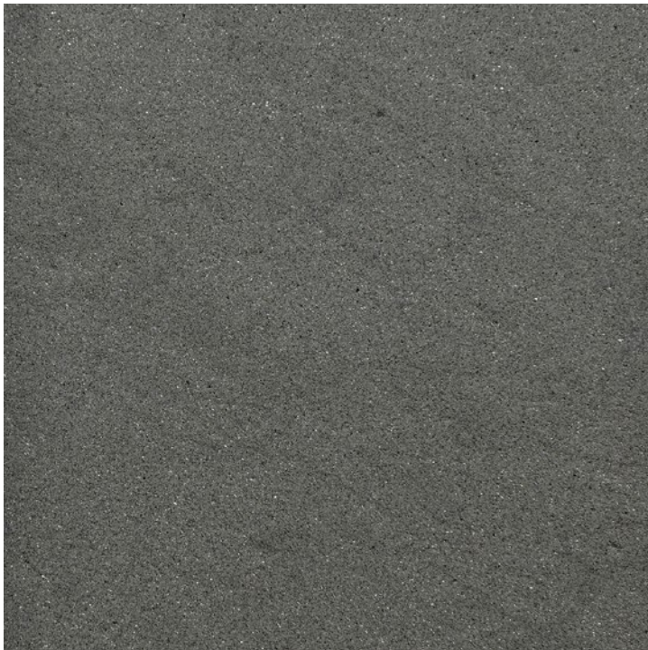
20 X 20 POLISHED SAMPLE